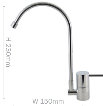
High Loop IT001157