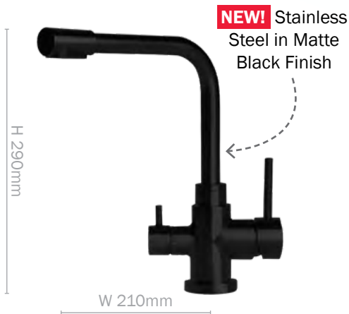
Standard Matte Black IT004096