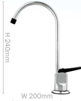
High Loop IT001161