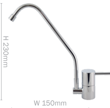
Long Reach IT001156