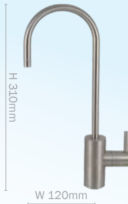
IT003381 Spring Loaded