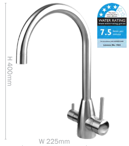
High Loop IT001166