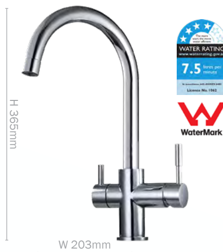
High Loop IT003855