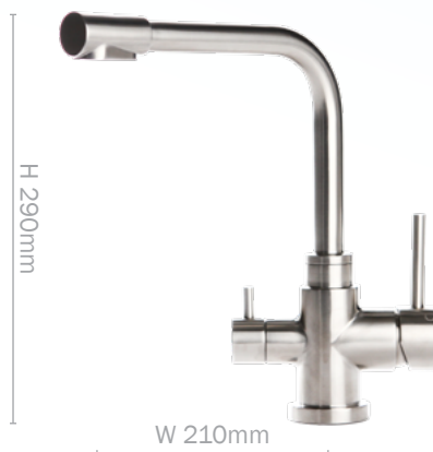
Standard IT002170 Premier