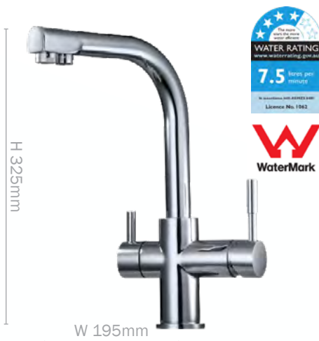
Long Reach IT001169