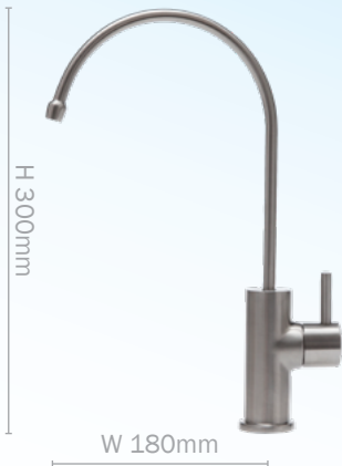
High Loop IT002350 Classic

Our Stainless Steel Filtered Water Faucets and Mixers feature a brushed chrome finish.