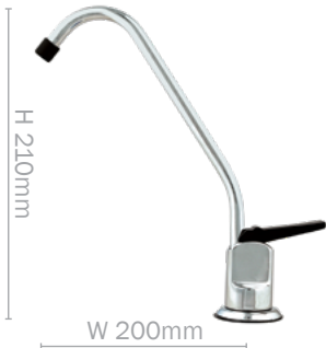
Long Reach IT001155

Included with your purchase of an Undersink Filter System. All our Standard Filter Faucets feature a chrome finish and include a base plate and connection fittings.