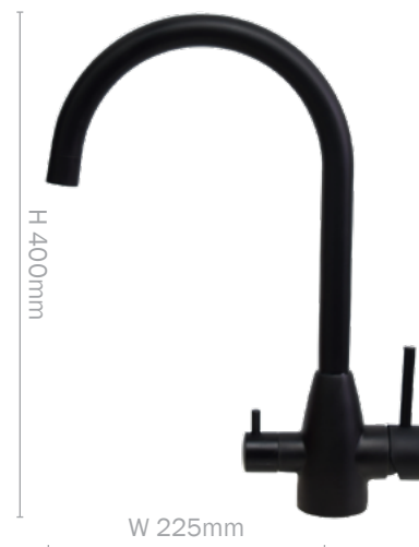
High Loop Matte Black IT004052