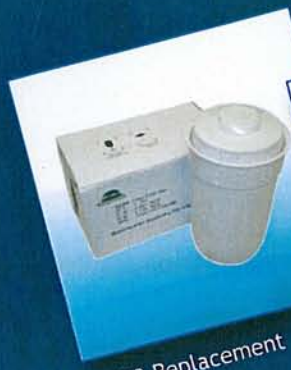
F-RB3 Replacement cartridge