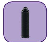
2 Carbon Block