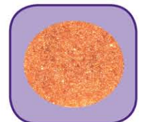
3 Ion Exchange Resin